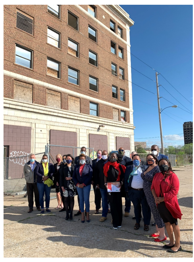
Members of the development team and local and state partners stand in front of the vacant hotel in early April.

university owned the entire building, adapting it for university use. Legendary dancer, choreographer and scholar Katherine Dunham operated the Performing Arts Training Center in the former hotel building from 1971 through the late 1980s.