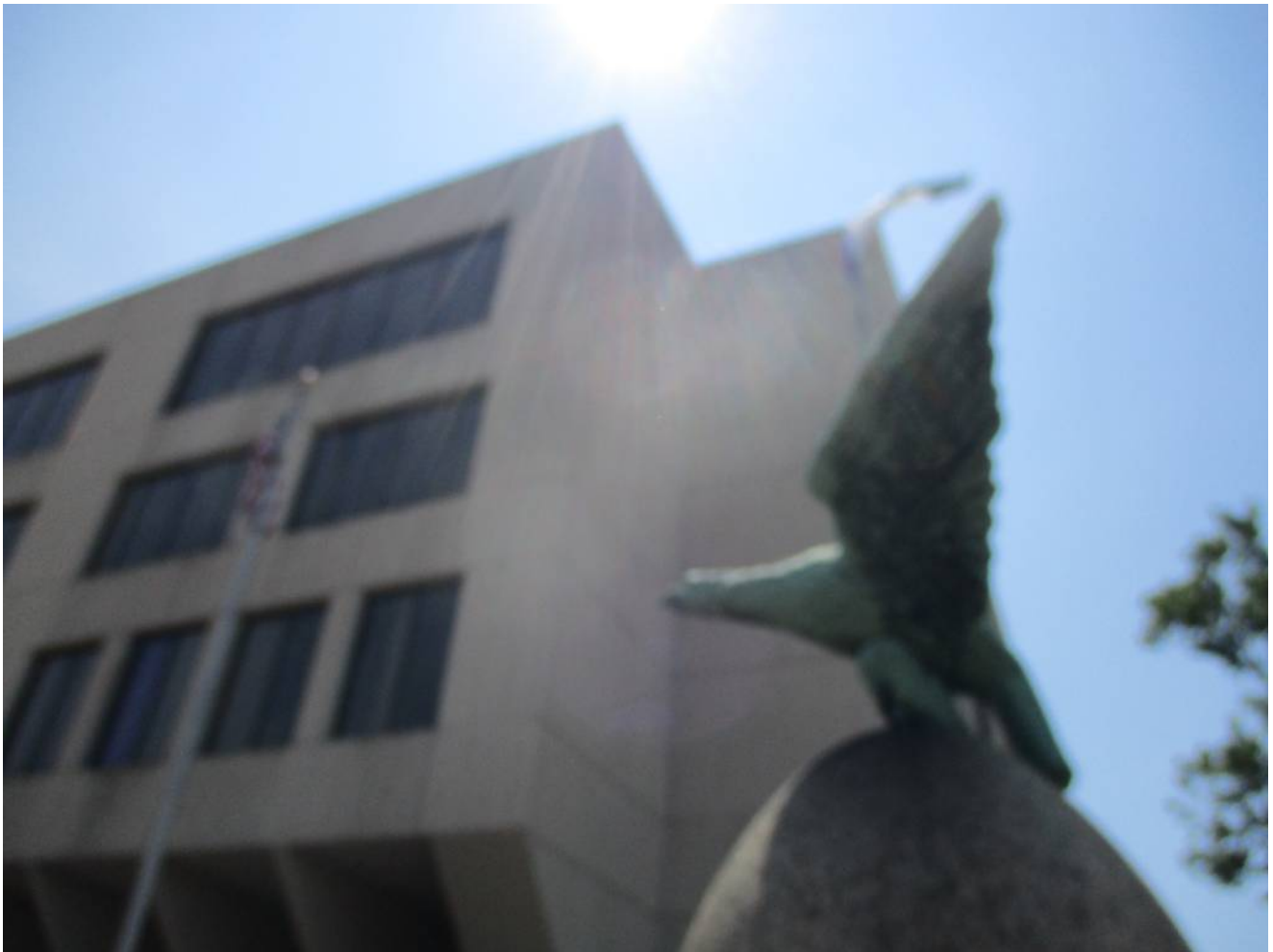
The old Will County Courthouse seen on Aug. 5, 2021.

“The event, which showers a historic building with public displays of affection, will bring attention to the architecturally significant courthouse currently threatened with demolition,” states a news release from Landmarks Illinois.