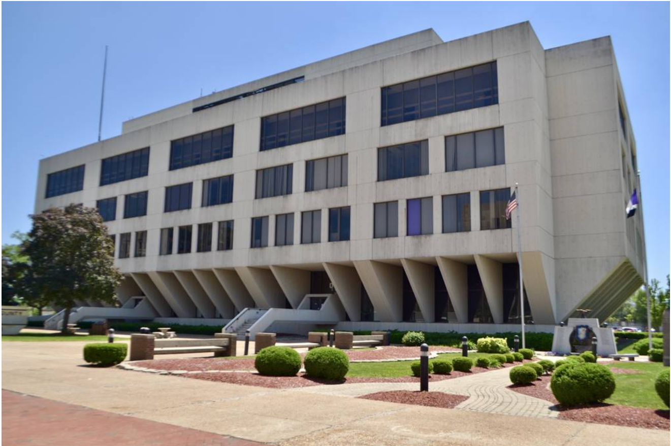
The old Will County Courthouse sits vacant in downtown Joliet on June 7, 2022.

Landmarks Illinois is making a plea to give preservation a chance.