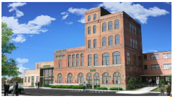
17: The Brew House, Rockford