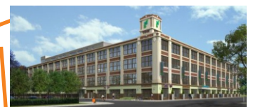
5: Green Exchange, Chicago