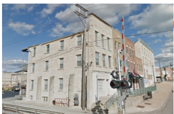
3: 18 West 9th St., Lockport