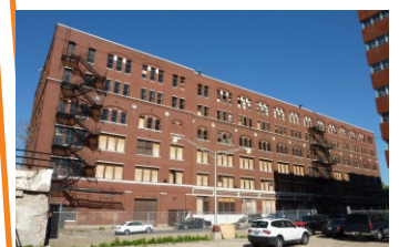
7: Sears MDL Bldg, Chicago