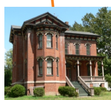
12: Bountiful B&B, Cairo