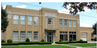
18: Coca Cola Plant, Quincy