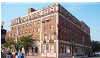
11: Joliet Senior Suites, Joliet