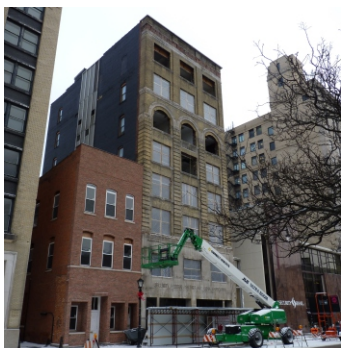
13: Booth Building, Springfield