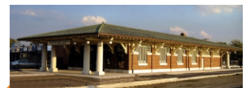
9: Dempster Station, Skokie