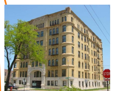
1: Yale Apartments, Chicago