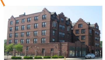
15: Holland Apartments, Danville