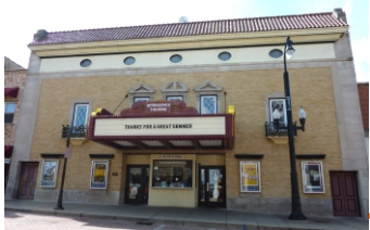
14: Miller Theatre, Woodstock