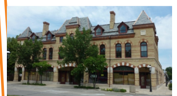
4: Arcade Building, Riverside