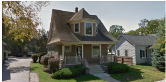
6: 613 W. Main, West Dundee