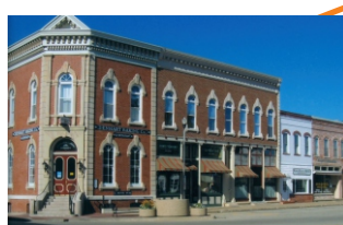
18: Denhart Bank, Washington