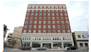
10: Karcher Lofts, Waukegan