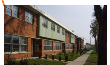
2: Pacesetter Homes, Riverdale