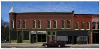
16: 224-230 Madison, Ottawa