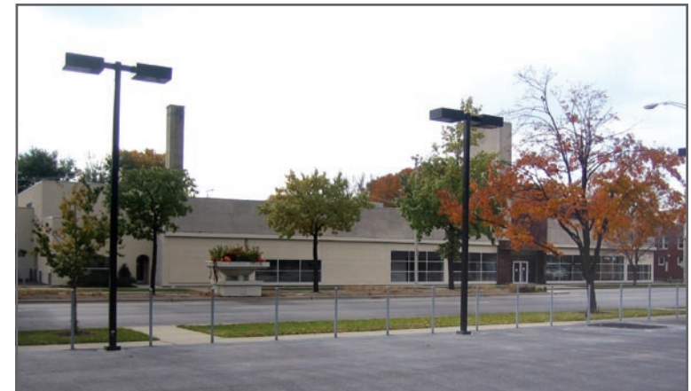
711 MADISON STREET, OAK PARK, IL

NAI Hiffman Commercial Real Estate Services, Worldwide.