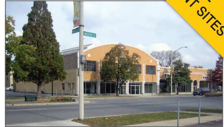
644 MADISON STREET, OAK PARK, IL