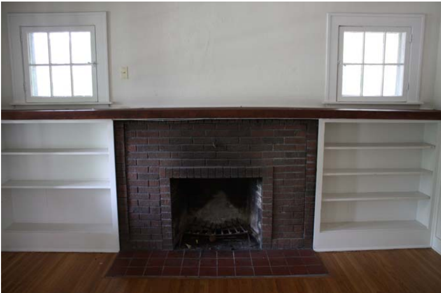
Detail of fire place and built in bookshelves