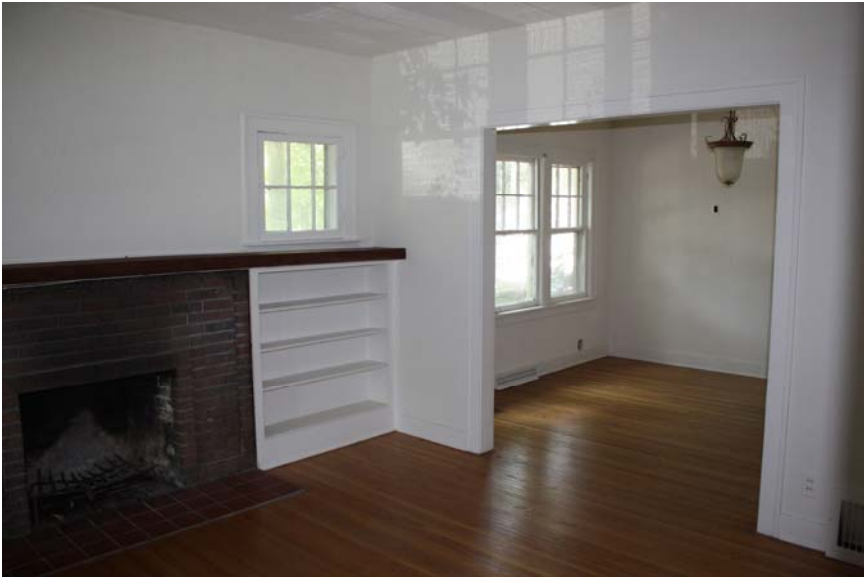
View of living room & dining room