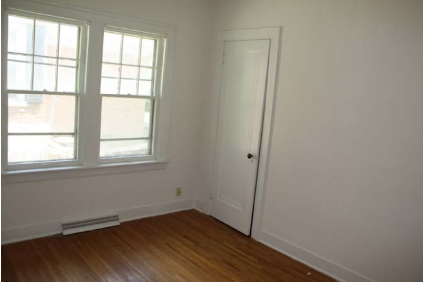
View of bedroom #2