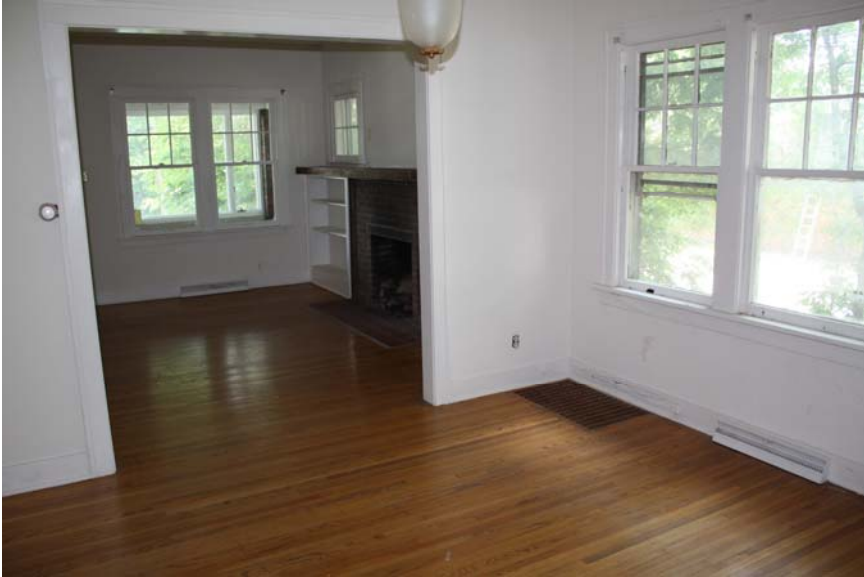
View of dining room & living room