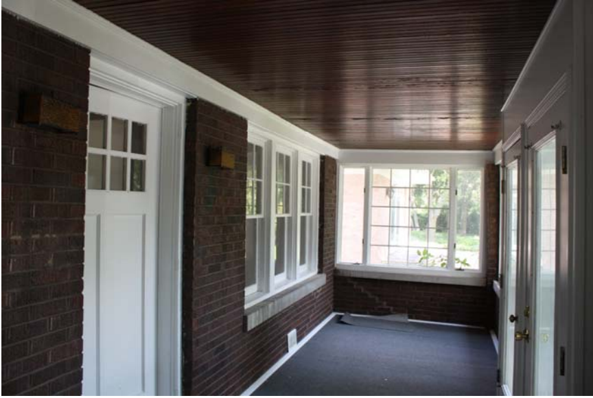
View within front porch, note original wood door and tongue & groove wood ceiling