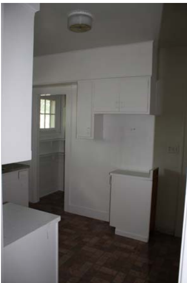
View of kitchen