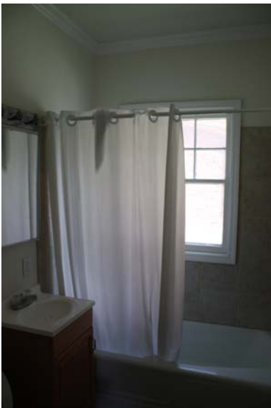
View of bathroom & bedroom # 1