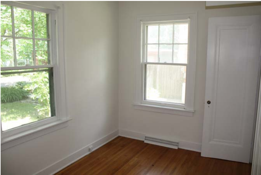
View of bedroom # 3