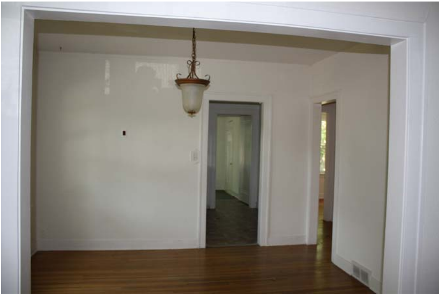
View of dining room and doorways into kitchen and bedrooms 2-3 and bathroom